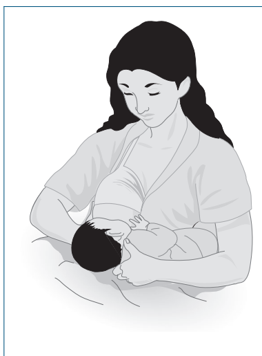
Figure 2. Cross Cradle