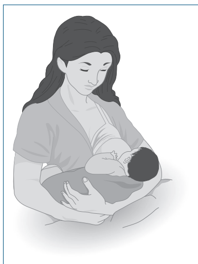
Figure 1. Cradle