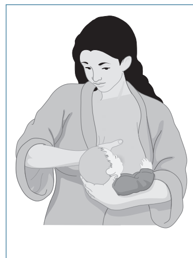
Figure 3. Football Hold